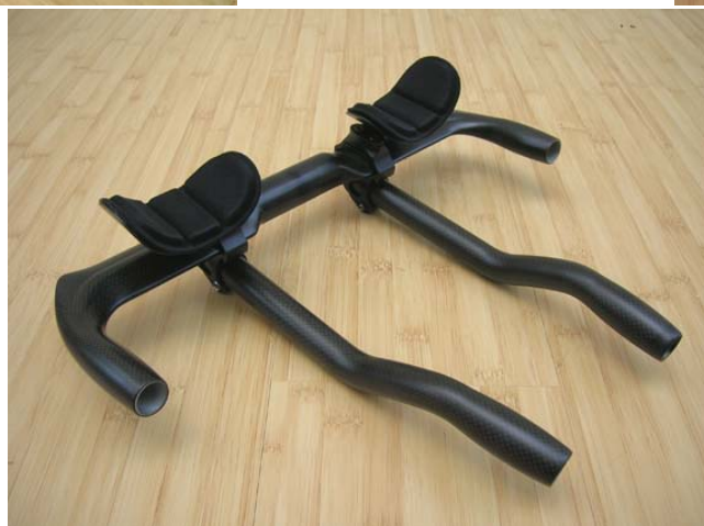
COURSE RECORD PRIZE Davanti carbon aero bar package RRP: £195