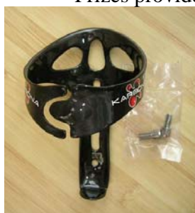
Karbona ‘Castle’ Bottle cages RRP: £24.95 each